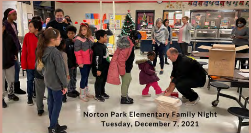
Norton Park Elementary Family Night Tuesday, December 7, 2021

Community Outreach: On December 7, the Library’s Youth Services department participated in Norton Park Elementary’s Family Night. Participants learned about behavioral expectations in different public settings like businesses, libraries, and parks.