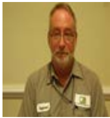
Raymond Ferguson Street Department