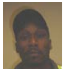
Wallace Applebee Water/Sewer Department

Public Works Quarterly Recognition for Outstanding Work: These employees have gone above and beyond. They have instilled new employees with the same dedication to the City of Smyrna and its citizens that they bring to work every day. These outstanding men are the bedrock upon which the Public Works Department rests.