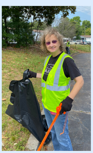
Community Cleanup: Last Thursday, five Keep Smyrna Beautiful volunteers picked up 106 pounds of litter, including 42 pounds of recyclable material, on Benson Poole Road.