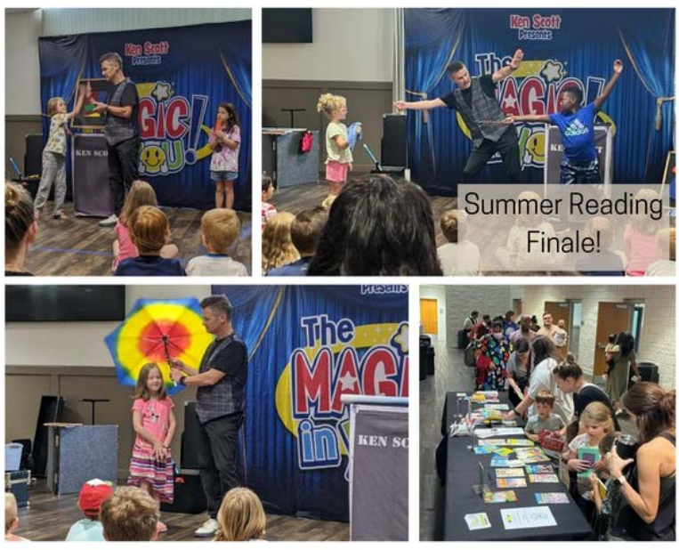
Summer Reading Finale!