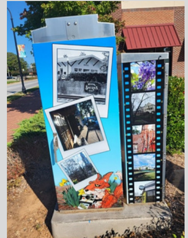
Artist: Leafmore Studios - Becca McCoy Location: Atlanta Road and Church Street (near Publix Jonquil sign)