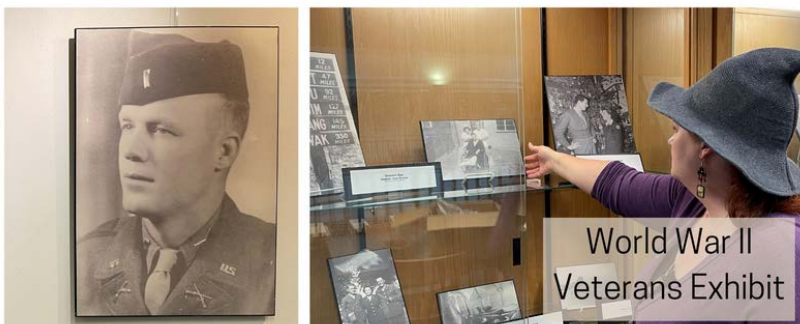
World War II Veterans Exhibit