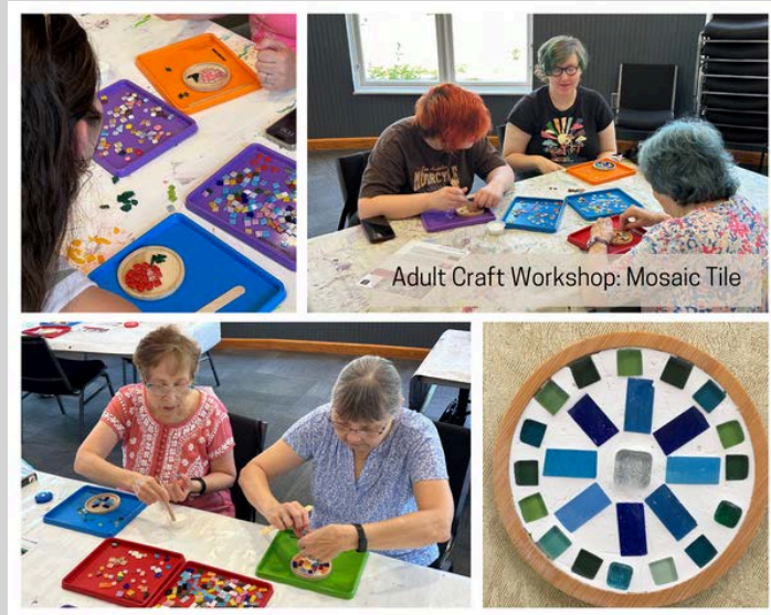
Adult Craft Workshop: Mosaic Tile